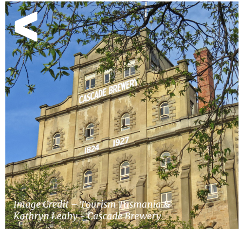
Cascade Brewery

A n iconic local institution, Cascade Brewery is celebrating its 200th year quenching the thirst of Tasmanians and hopheads alike, and participants are invited to take part in the revelry. To fittingly mark the occasion, on the first Friday of each month Cascade are offering a free beer to the first 200 patrons at select venues around Tasmania. This promotion is set to run until the end of the year and involves Cascade's signature Draught, Lager and Pale Ale brews. And if more of a history buff than a beer drinker, or perhaps you're both, then a tour of the historic Cascade Brewery is right up you're alley. Set amongst the rolling foothills of Mount Wellington, kunanyi, explore the surrounding gardens of Australia's oldest brewery and learn the craft behind Australia's oldest continuously brewed beer. www.cascadebreweryco.com.au 🐦