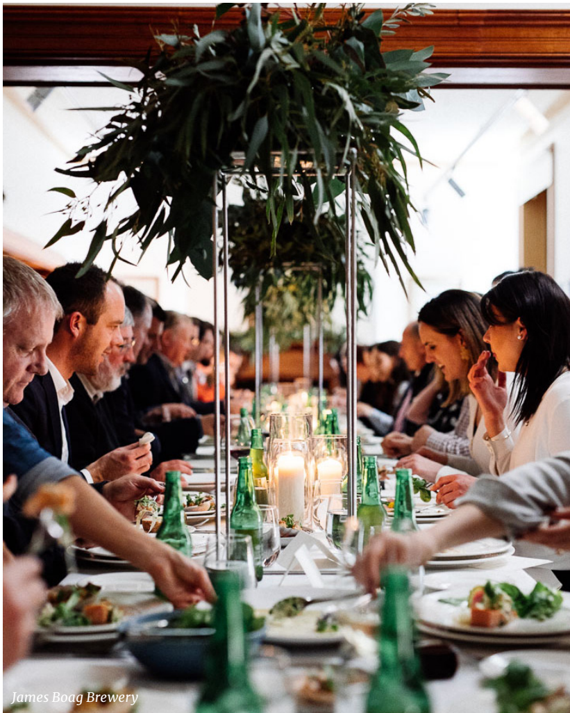
James Boag Brewery

Launceston is full of photo opportunities. Wandering the streets with camera in hand is recommended to capture St. John's Church or the magnificent Town Hall, both built in the 1800s. Behind Launceston's elaborate architecture can be found the eateries that help shape its vibrant food culture as a UNESCO City of Gastronomy. It won't be hard for your group to find an Instagram-worthy dish or two.