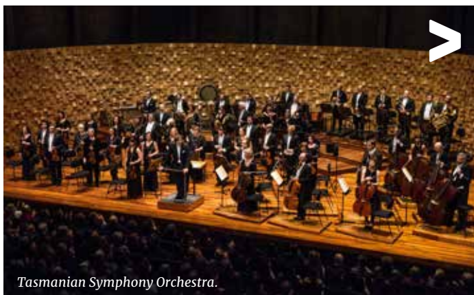
Tasmanian Symphony Orchestra.