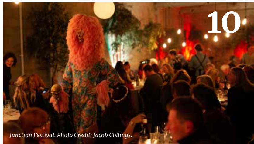
Junction Festival.