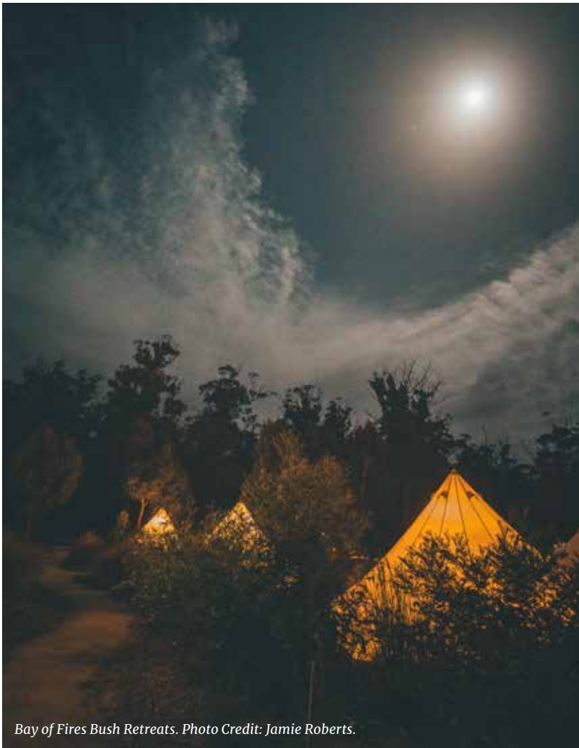
Bay of Fires Bush Retreats.