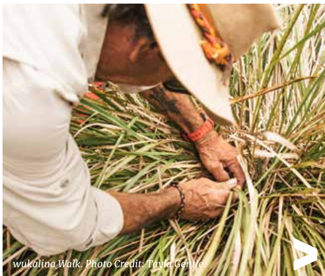
wukalina Walk.

T asmania is celebrating a swag of medals at the 2022 Qantas Australian Tourism Awards. Amongst the medallists are Business Events Tasmania members Bangor Vineyard Shed taking gold (Tourism Wineries, Distilleries & Breweries), and bronze went to Peppers Silo Hotel (Business Events Venues) and Mures Tasmania (Tourism Restaurants & Catering Services).