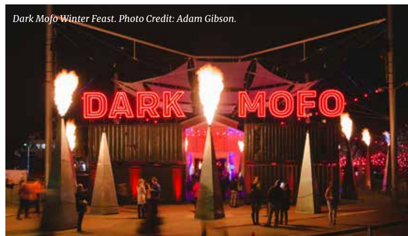
Dark Mofo Winter Feast.

Worn a puffer jacket (a Tassie Tux) to Winter Feast, and experienced Dark MOFO festival. 🐧