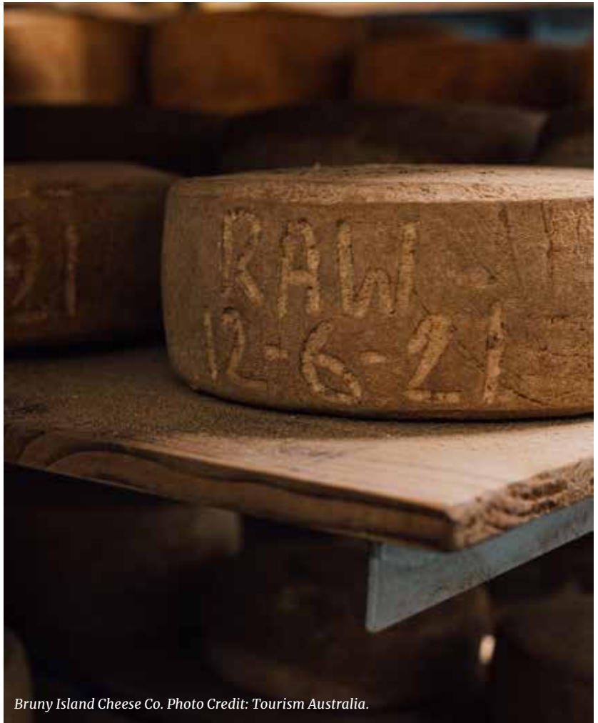
Bruny Island Cheese Co.

In 2017 Nick started Glen Huon Dairy Co, acquiring a now organically certified farm that is home to some (very happy) rare breed cattle, and sole supplier of milk to Bruny Island Cheese Co. As if that were not enough, Bruny Island Beer Co was also established around the same time, making beer that much like their cheese, is an artisanal product that strives to be the best expression of the seasonally variable ingredients available in the region. Or in layman's terms... for cheese makers they make bloody great beer!