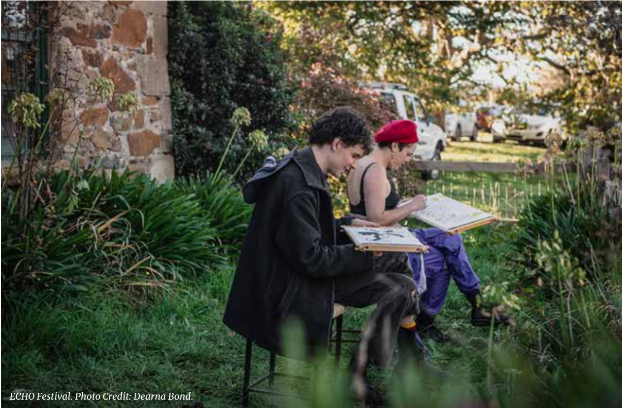
ECHO Festival.

Here the Rest take on The West in an attempt to crack the greatest homeground advantage in the state. Built in 1895, Queenstown's iconic gravel oval is not for the faint of heart, with blood, sweat and tears shed by locals and blow-ins alike across the four quarters of this gruelling AFL match, that is a nod to the west coast's culture of 'west coast tough' where the people either find a way or make a way!