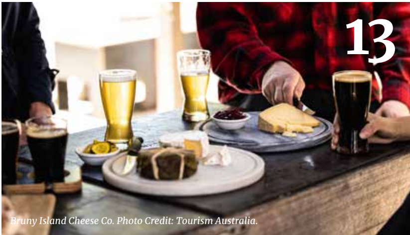
Bruny Island Cheese Co.