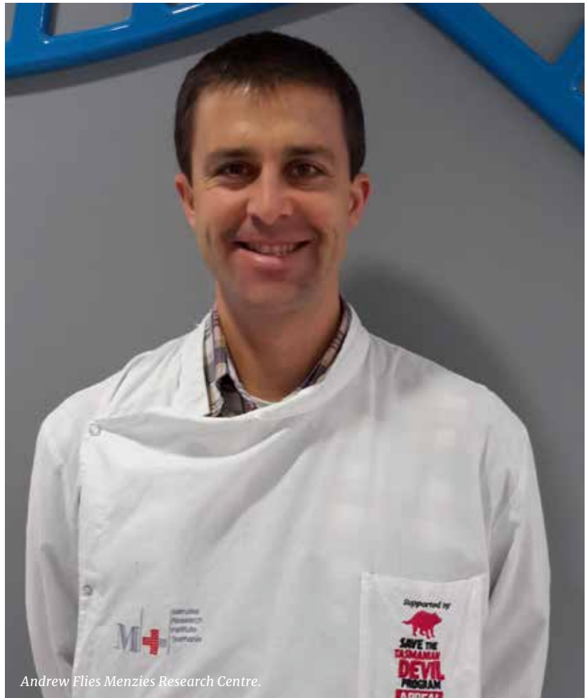
Andrew Flies Menzies Research Centre.

In 2022, Andi's work brought the Third Biennial Australian Industrial Hemp Conference to Launceston. An impressive program of national and international speakers included a post event field day, giving delegates a truly unique opportunity to witness nearly all aspects of hemp production and processing in one day – made possible because unlike big cities, our conferencing facilities in Tasmania are close to farming