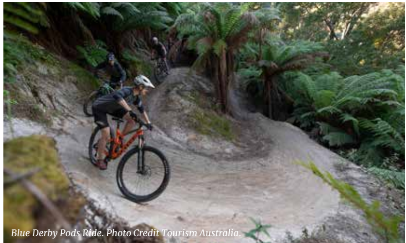
Blue Derby Pods Ride.

After a fair bit of travel in my early 20s I simply can't imagine living anywhere else. I love to travel and work for fun, and I've