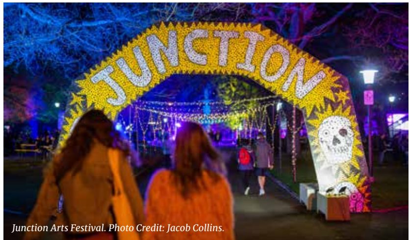
Junction Arts Festival.