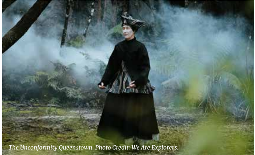
The Unconformity Queenstown.

With so many Tasmanians invested in our island's rich cultural landscape, it is little