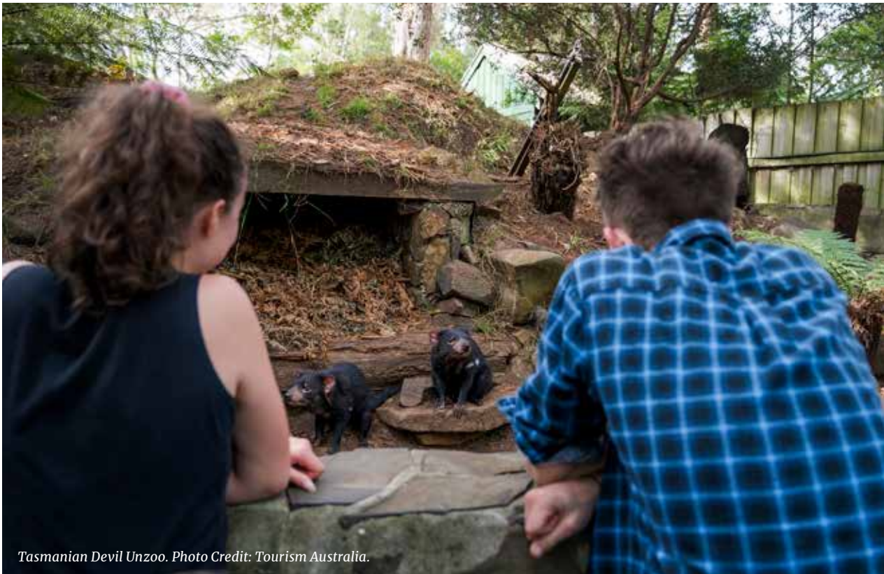
Tasmanian Devil Unzoo.

Visionaries come from a range of sectors and with a wealth of knowledge and experience, and each has a unique story to share.