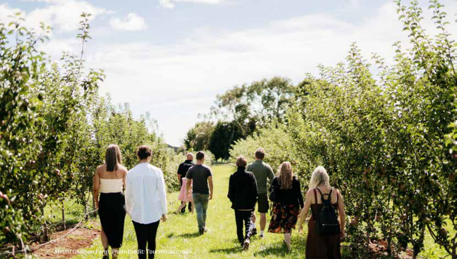
Mount Ghomon Farm.