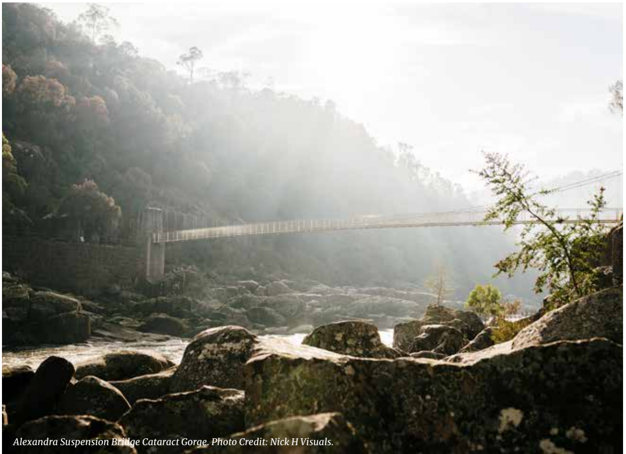
Alexandra Suspension Bridge Cataract Gorge.

A t last, after years of COVID disruptions and multiple postponements, it gives the entire Business Events Tasmania team great pleasure to welcome delegates to Tasmania and show them around our home.