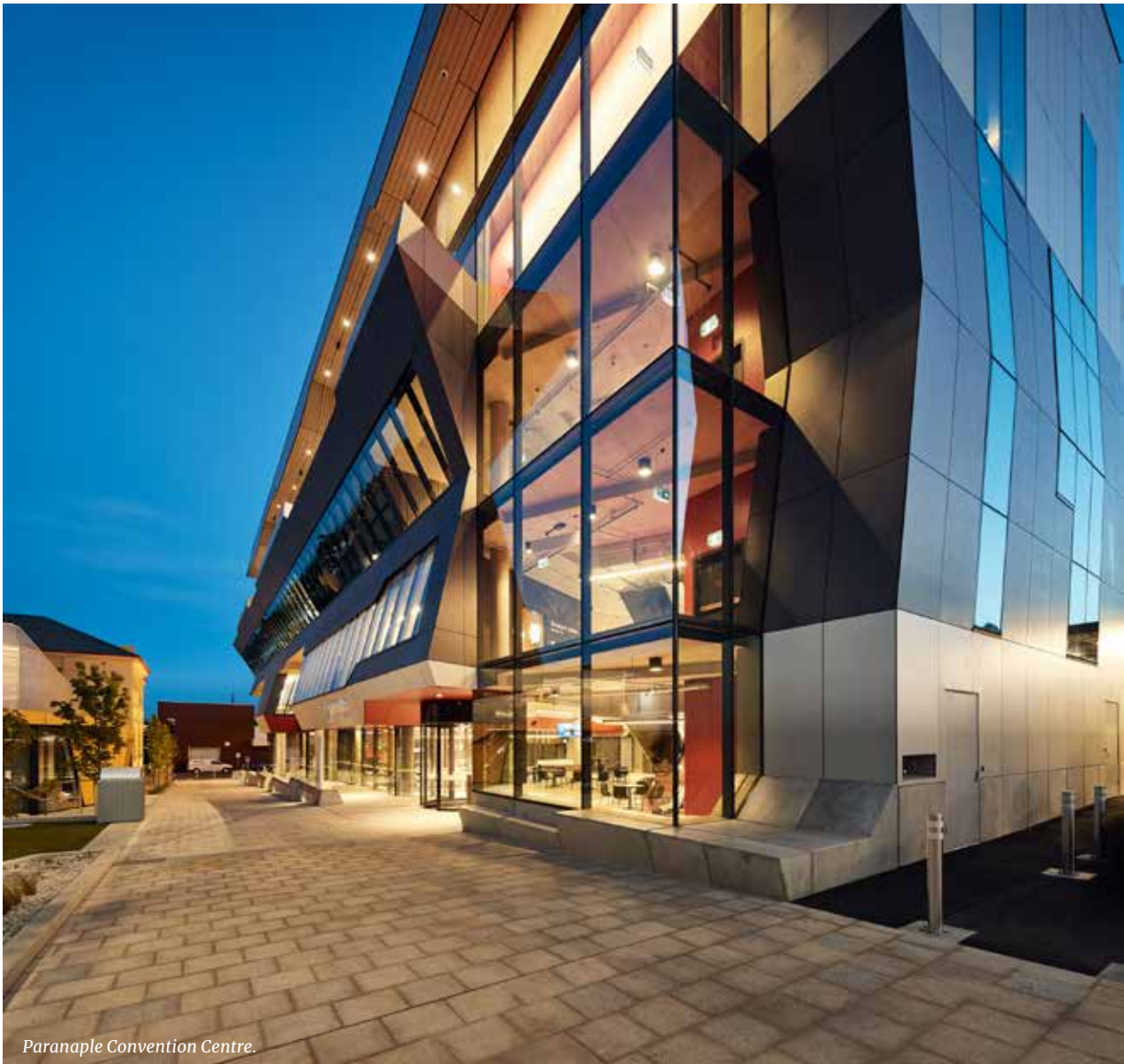
Paranapple Convention Centre.

After decades of ingenuity across agriculture, aquaculture, forestry, fishing, mining and advanced manufacturing, the secret of this stunning part of Tasmania is finally out, and the region is adding tourism and events to a long list of industries it excels in.