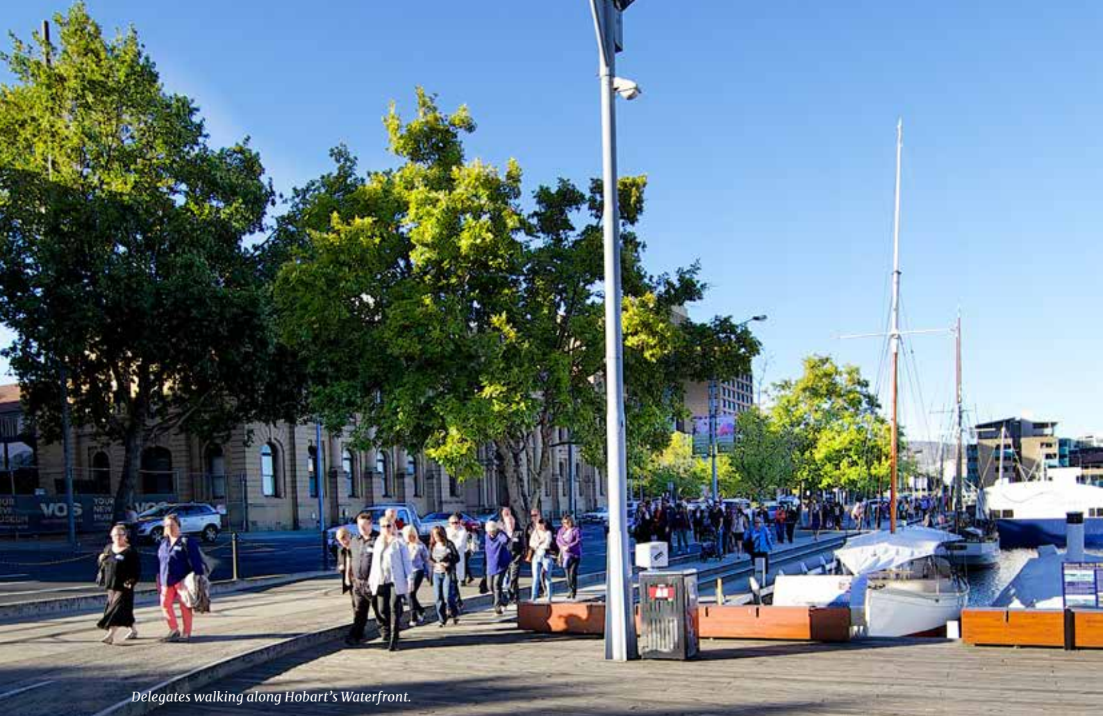
Delegates walking along Hobart's Waterfront.