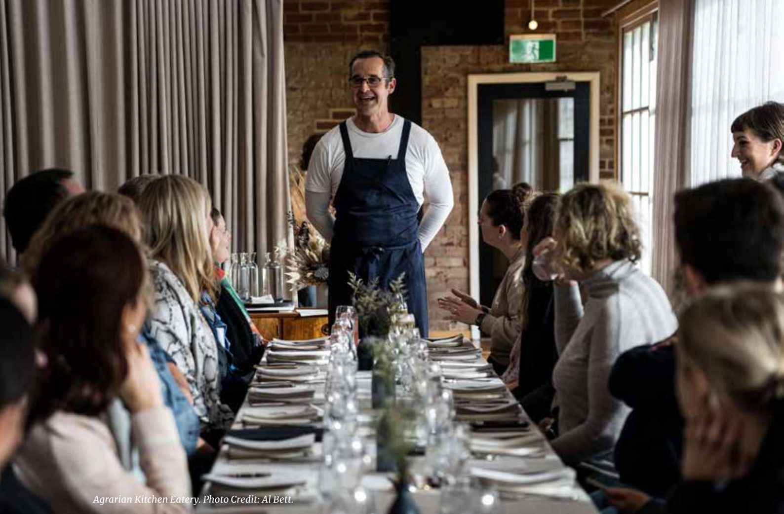
Agrarian Kitchen Eatery.