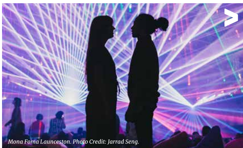
Mona Foma Launceston.

M ona Foma is iconic. Mona's summer festival of art, music and other stuff held across two weekends in February – Launceston 17–19 February and nipaluna/Hobart 24–26 February. It is an eclectic showcase of bands, performance, art, food and booze. This year's festival program includes a film noir opera, book club of sonic librarians, group exhibitions of artists envisioning 'blackened utopias', existential threats and the general idea of apocalypses... and headline act Bon Iver playing in the south. Head to www.monafoma.net.au for full program details. 🐦