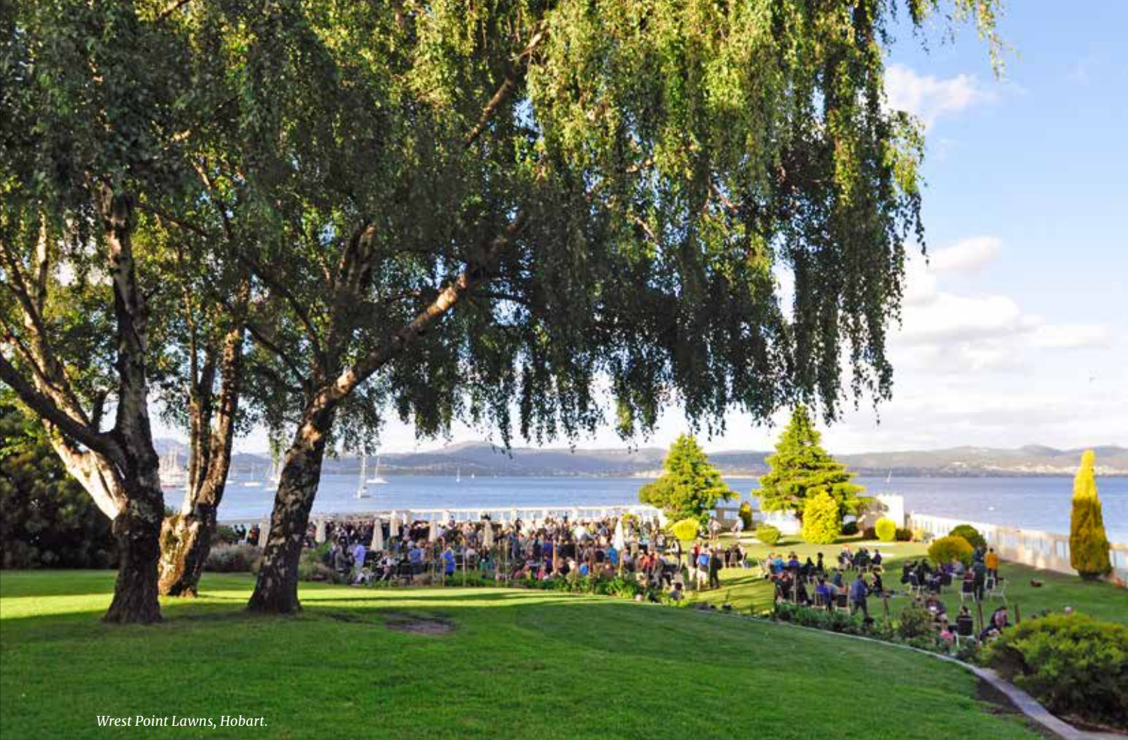
Wrest Point Lawns, Hobart.