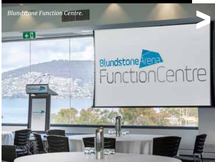
Blundstone Function Centre.

www.blundstonearena.com.au/function-centre 🐾