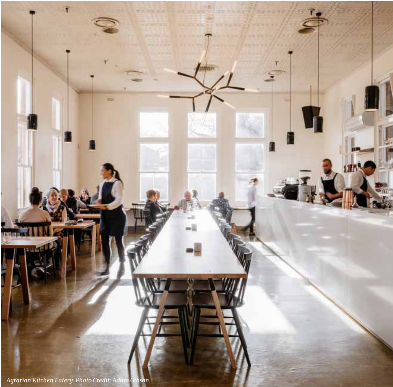
Agrarian Kitchen Eatery.

At Business Events Tasmania when working with our clients to develop itineraries and encourage event organisers to hold a business event in the island state, we often speak of the Tasmanian way of backing yourself in to achieve success.