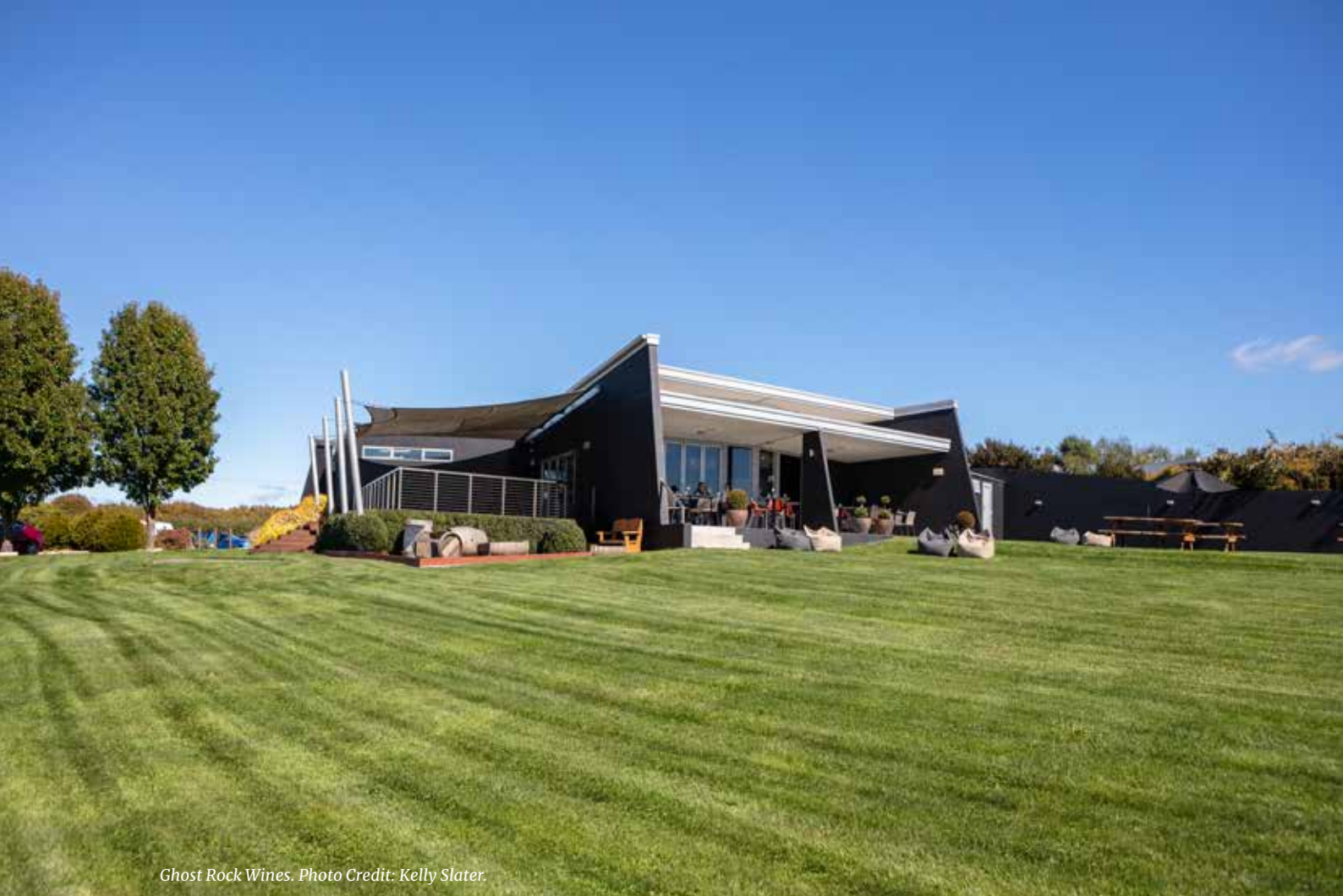
Ghost Rock Wines.