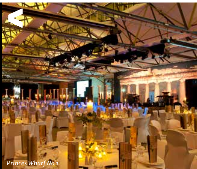
Princes Wharf No.1.

O verlooking the stunning Derwent River in Hobart, Blundstone Arena Function Centre offers a unique range of modern and flexible function facilities and first-class corporate hospitality packages. With panoramic views, state-of-the-art audiovisual equipment and an exceptional culinary experience, Blundstone Arena Function Centre is a popular choice for offsite events.