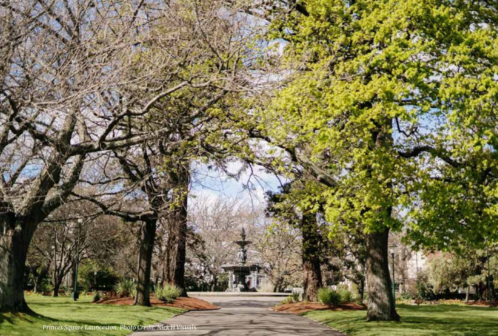
Princes Square Launceston.

Wrest Point Hotel & Conference Centre is located in the yachting hub of Sandy Bay, just five minutes from Hobart's city centre and 25 minutes from Hobart Airport. Overlooking the River Derwent, the venue has many ways to enhance the delegate experience given this close proximity to the water.