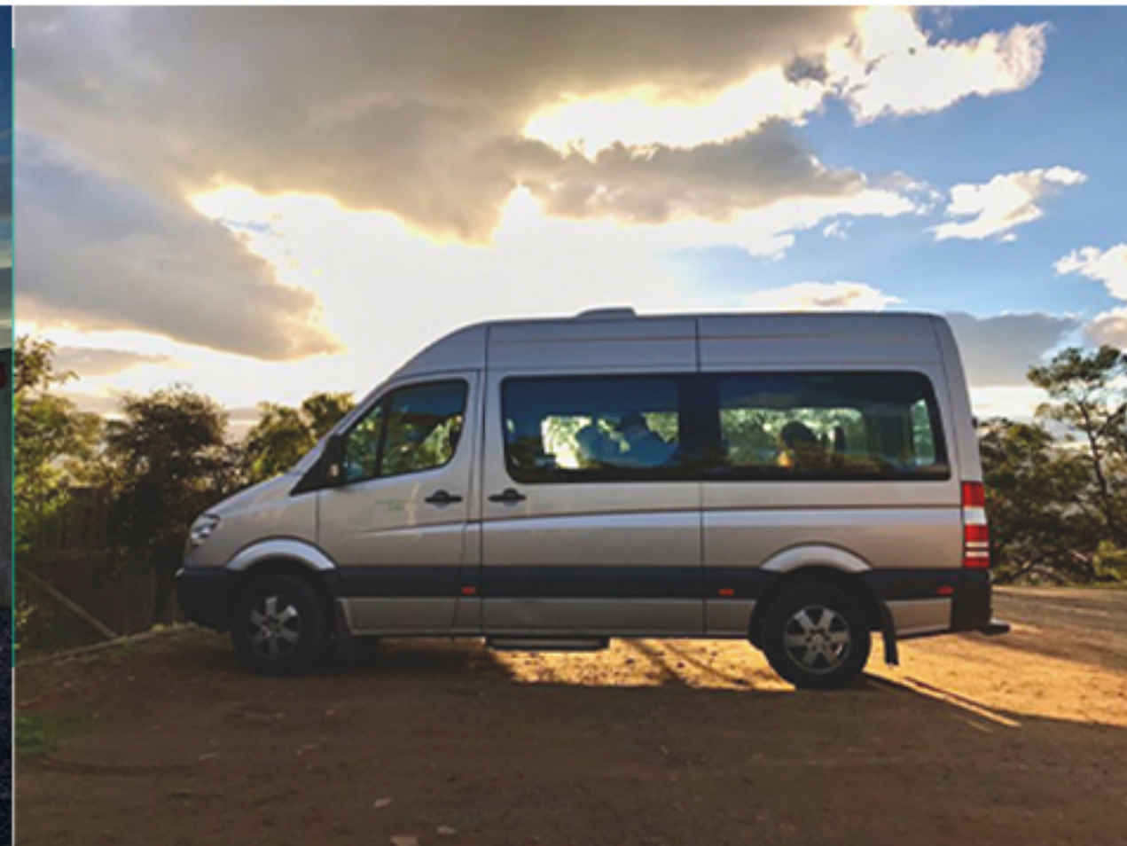
11 seater Benz