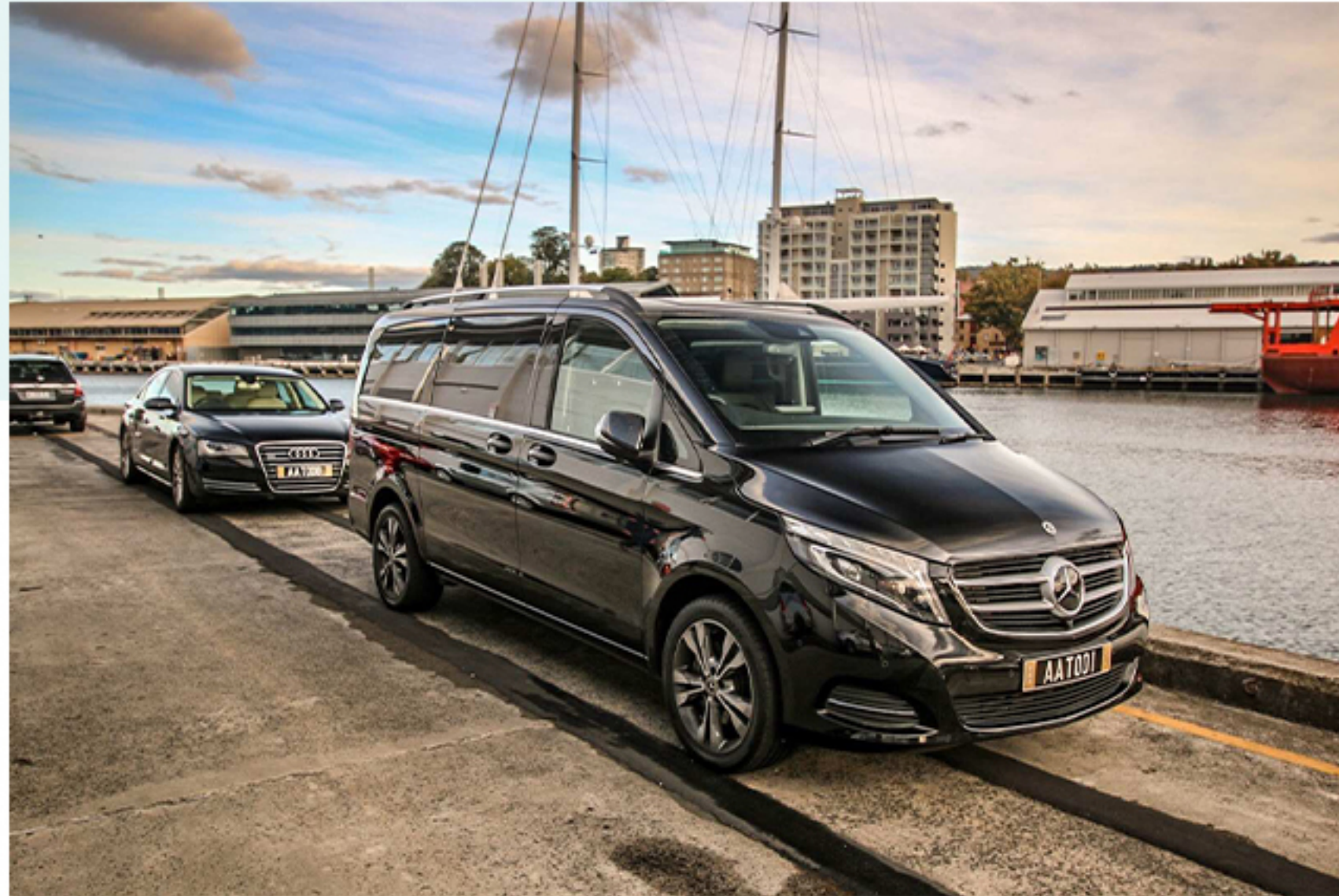
7 seater Benz