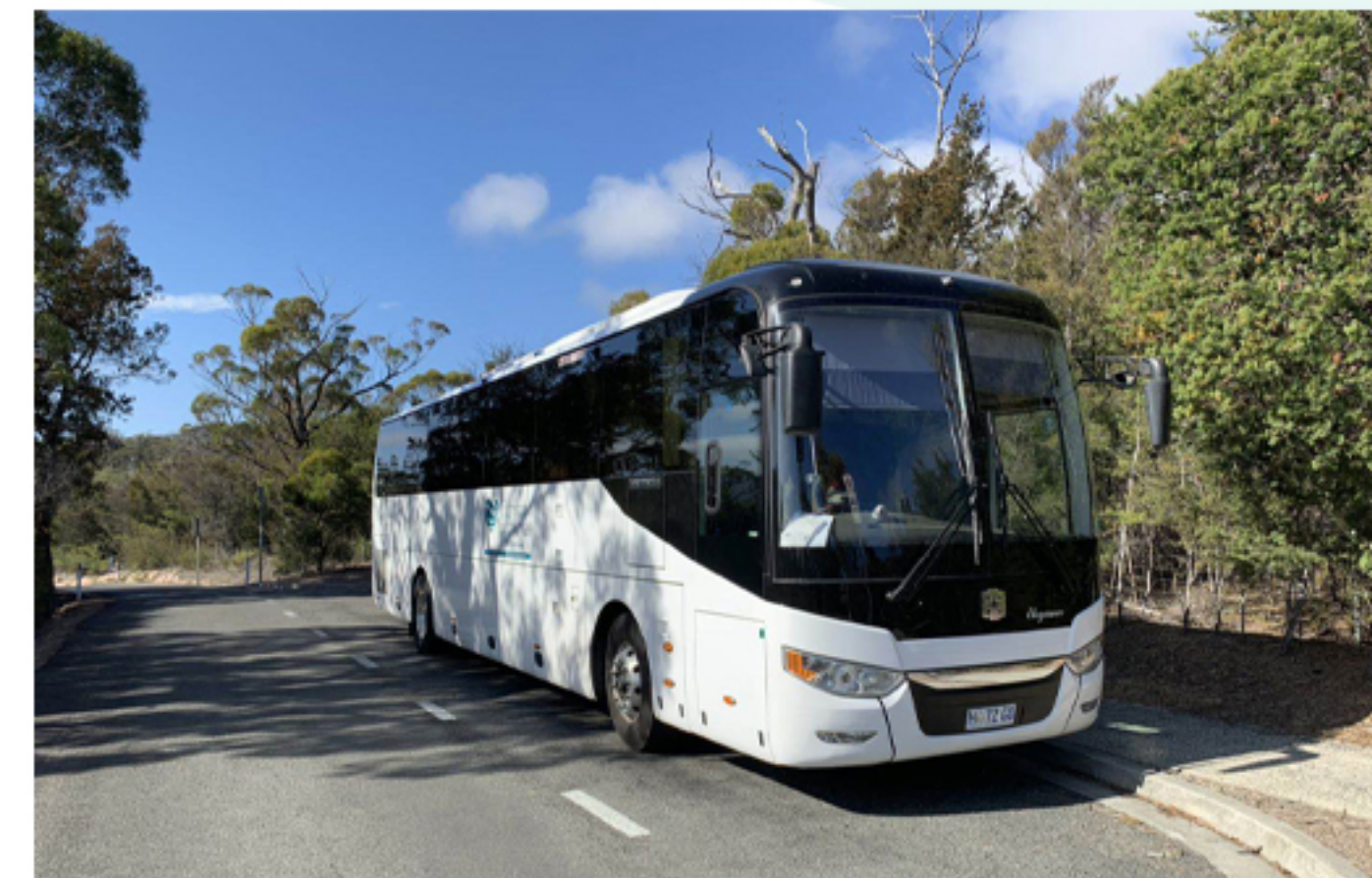
55 seater Zhongtong