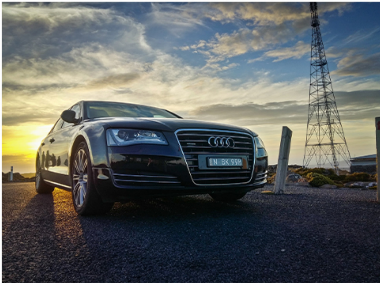
5 seater Audi A8