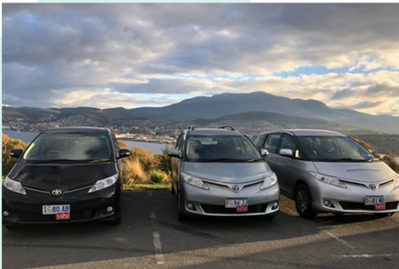
7 seater Toyota