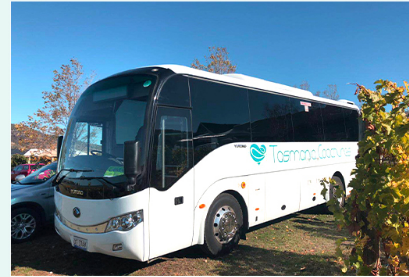
35 seater Yutong