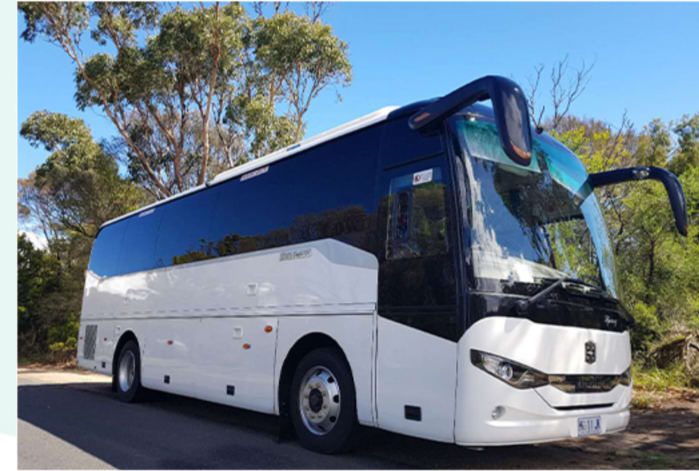
37 seater Zhongtong