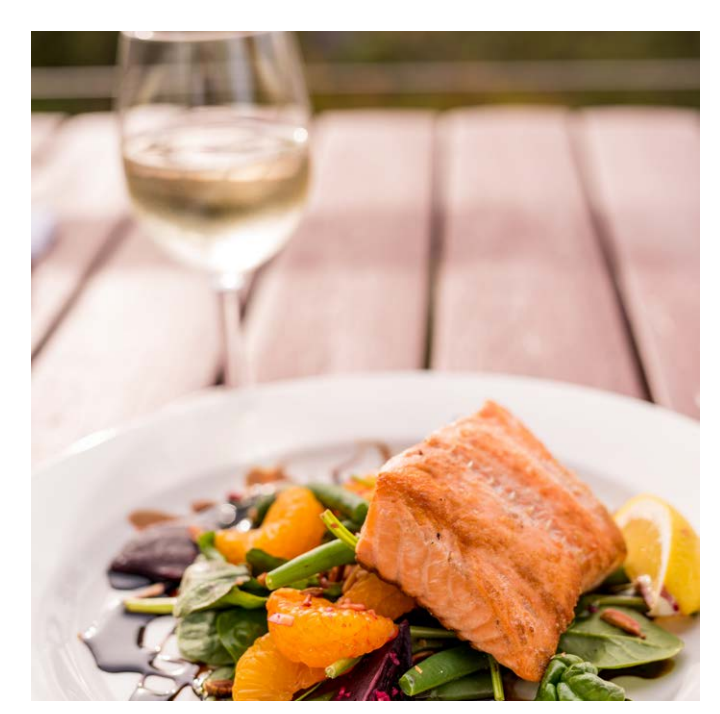
CRADLE MOUNTAIN HOTEL COMPENDIUM 2018