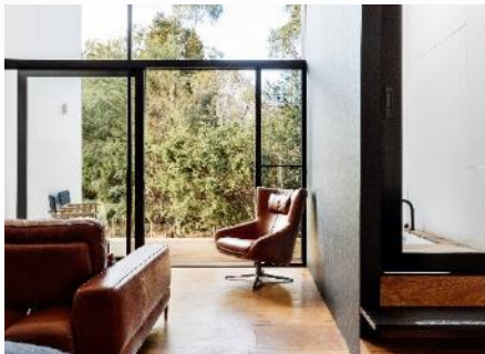
MOUNTAIN TERRACE FAMILY