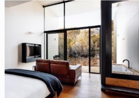
MOUNTAIN TERRACE KING