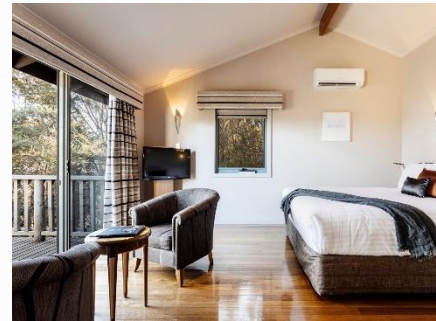
PREMIER SPA CABIN